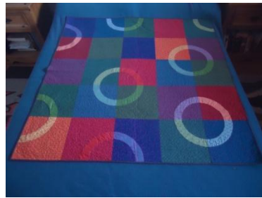
Double inset quarter circles