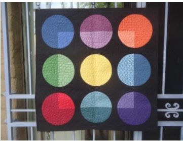
Inset quarter circles

Feel free to bring any curved seam projects you have in progress.