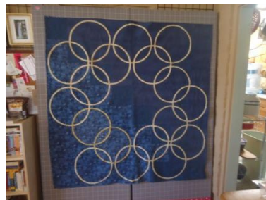
Bias strip quarter circles