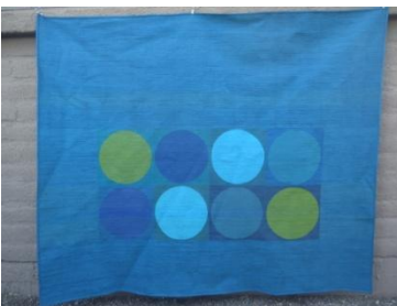
Inset whole circles